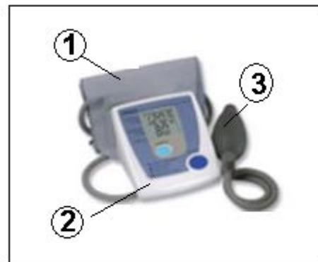
Manual inflation meter

Take a moment to determine which kind of blood pressure meter you have and to become familiar with its components.